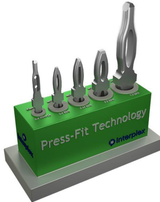
Figure 1: ENNOVI (formerly known as Interplex) miniPLX and miniEON press-fit contacts

whiskers cause other suppliers. The quality of the end-product is thereby assured for a prolonged period.